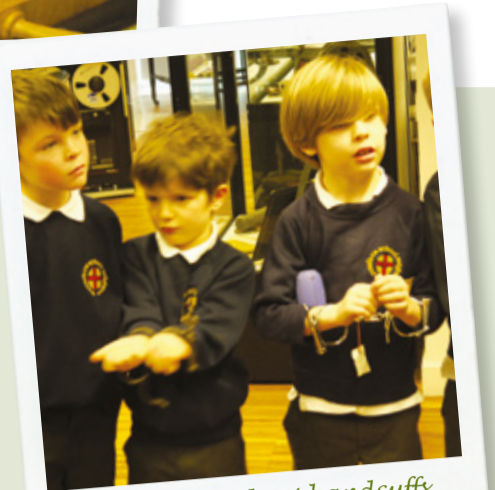
Learning about handcuffs at the Metropolitan Police Museum, London