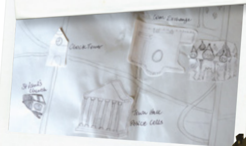
Creating an old map of Brighton with the girls from year 5