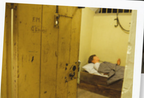
Right: inside one of the male Police cells