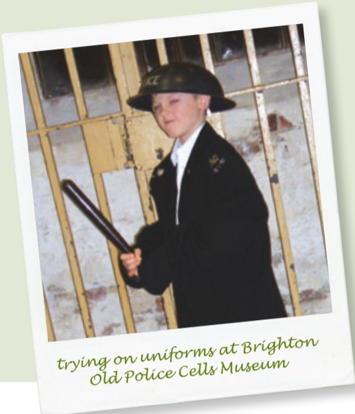
trying on uniforms at Brighton Old Police Cells Museum