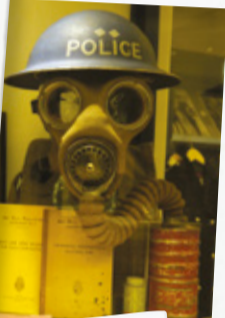
Looking at some original Police helmets