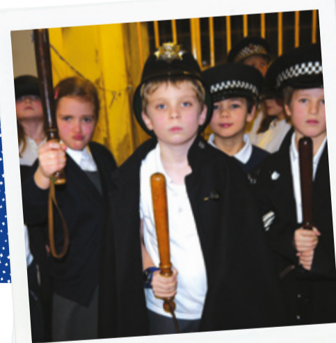
Trying on uniforms at Brighton Old Police Cells Museum