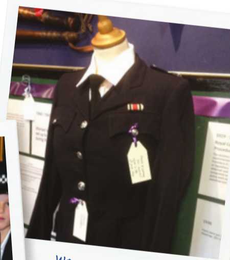
Women in Policing Exhibition

Women were not permitted into some professions and most married women were not allowed to work at all, plus, no woman could vote. Yet in this time, before Britain joined the War, Margaret Damer Dawson founded the Women's Police Service. The children in Year 3 of St Paul's Primary School in Brighton: those who are 7 and 8, undertook a special project to explore how women came to join the Women's Police Service, and all about Margaret Damer Dawson, who was actually born in Hove. They looked at the life of this extraordinary pioneer, and also the other women whose spirit changed history, and paved the way for women to be accepted in the Police Force today.